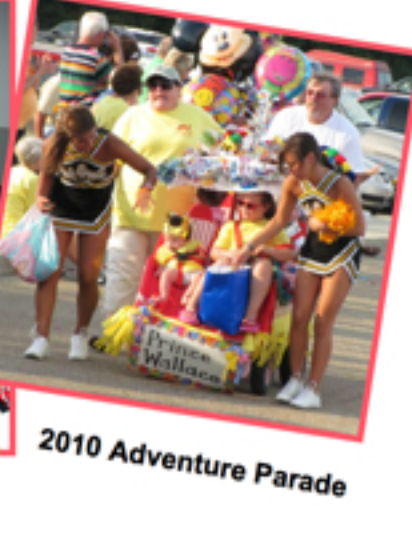
2010 Adventure Parade