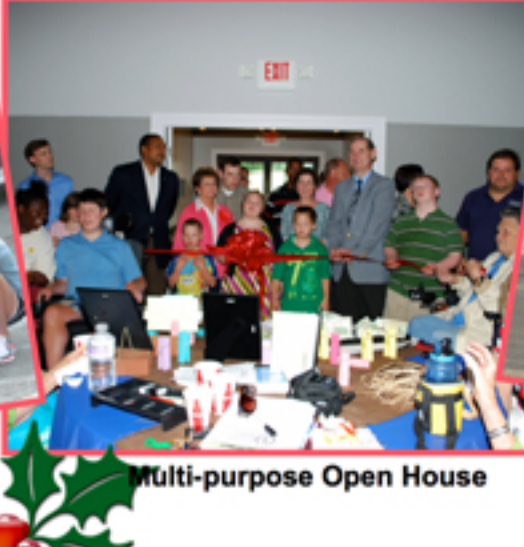
Multi-purpose Open House