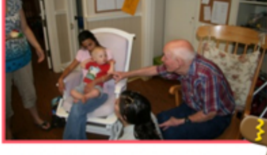
Mother's Day Out Open House