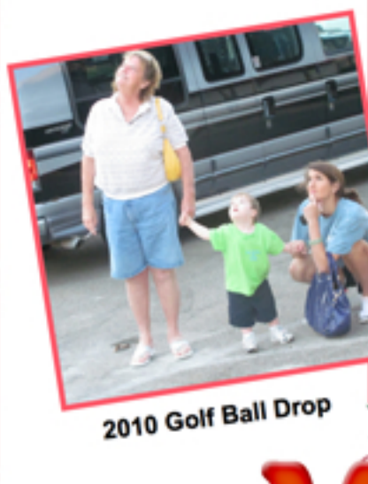
2010 Golf Ball Drop